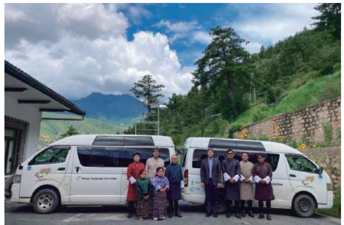
Welfare vehicles donated in 2019, Still in use today