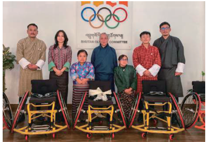
Wheelchairs presented to BPC

cherishing the vision of FGC, we will implement each program together with the people of Bhutan. We will continue our activities to foster a society that respects diversity through sports and education.