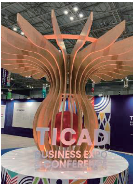
TICAD exhibition hall

The 9th Tokyo International Conference on African Development (TICAD 9) was held in Minato Mirai, Yokohama, for three days from August 20 to 22. TICAD is an international conference on the theme of African development, and many people, including heads of state of African countries, visited Japan.