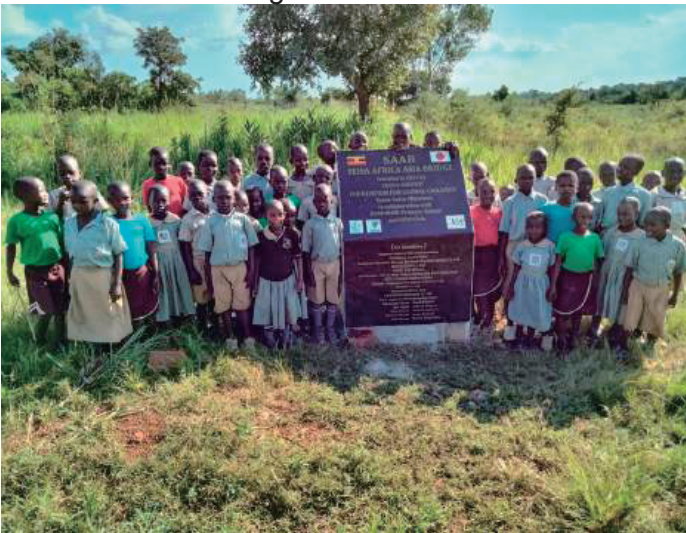
Commemorative monument for the completion of the bridge

FGC will continue to support KOMOREBI Primary School even after the completion of the bridge, including assistance for adding more classrooms. We sincerely appreciate your continued support.