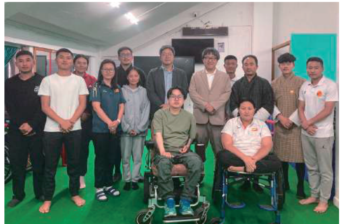
Visited the Rifle Shooting Federation