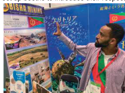
Introducing Eritrea's industries

The venue, Pacifico Yokohama, also hosted an exhibition event called the "TICAD Business Expo & Conference," where many Japanese companies shared their technologies with African countries, and in an area called the "Africa Lounge," African countries set up booths to introduce their respective industries and businesses.