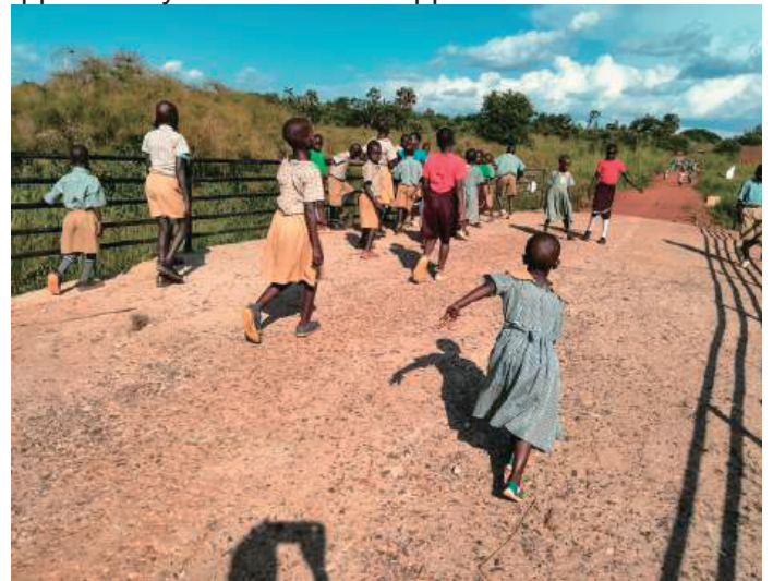
Children crossing the bridge on their way to school