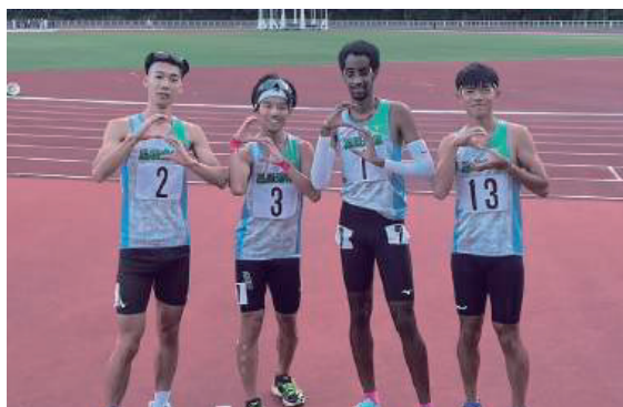
With his teammates from the university track and field club

It is solely because of your warm support that international students are able to study with peace of mind, immerse themselves in sports, and grow here in Japan. Once again, we would like to express our heartfelt gratitude. We would be grateful if you could continue to warmly watch over them as they strive for success in the future.