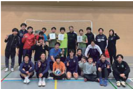
Participating elementary school students from Okuma Town

Since many of the children had little experience with soccer, we started by getting them comfortable with the ball, beginning with simple activities like walking while bouncing it by hand. In addition, they practiced dribbling and shooting, and at the end, the adults joined the children in playing a game. Although there were fewer participants than planned due to the flu outbreak, the children who joined were full of energy and enjoyed themselves alongside members of the local community.