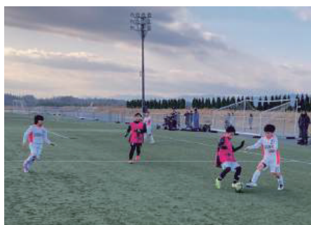
Heated matches were played