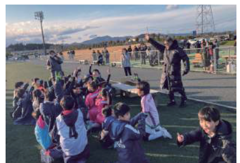
Everyone participated with great energy