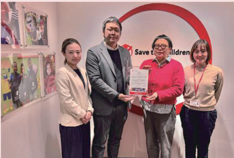
A visit to Save the Children Japan

We have donated a total of 300,000 yen to the international NGO "Save the Children," combining the donations we received from everyone with funds from our foundation. Upon presenting this donation, we received a detailed update from Save the Children Japan regarding the current situation and their activities on the ground. With a history spanning over 100 years, the organization has been providing long-term support in Myanmar. In response to this earthquake, they are implementing multifaceted relief efforts, including the distribution of supplies, medical assistance, psychological care for children, and educational support. The funds donated this time will be used directly to support these on-the-ground activities. Once again, we would like to express our heartfelt gratitude for your overwhelming support. We will continue to provide support to protect the smiles of children in the event of disasters both domestically and internationally. We would appreciate your continued understanding and support.