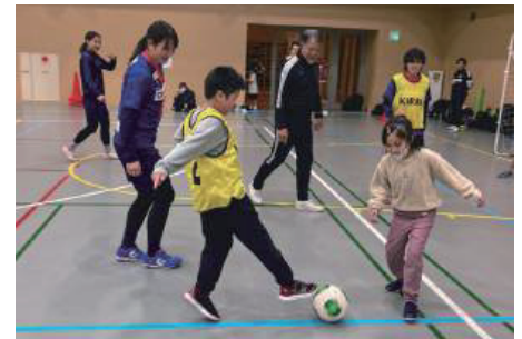
Support from a local women's team