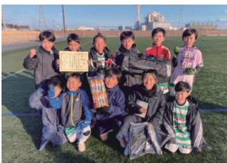
Congratulations to the champions, FC ORQUESTA!

We are committed to continuing these activities to ensure that the children of Fukushima can smile through sports and grow healthy in both mind and body. We would like to express our heartfelt gratitude for everyone’s cooperation and support. We would be deeply grateful for your continued warm support and encouragement for this project.