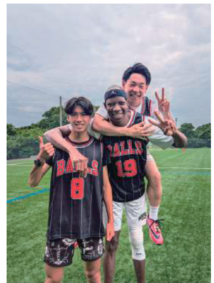
At the school festival during his senior year of high school