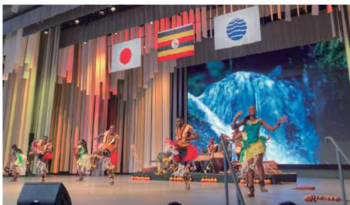
A gorgeous traditional dance from Uganda

Although the Osaka-Kansai Expo concluded on October 13th, FGC attended the National Day of the Republic of Uganda on October 8th.