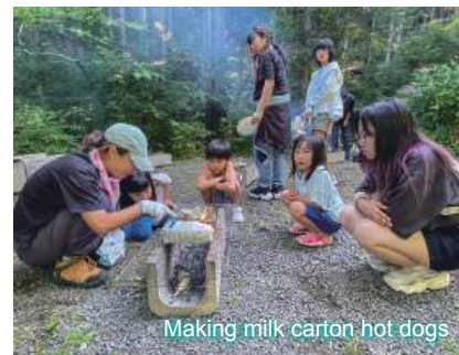
Making milk carton hot dogs

Day 2 started with making carton hot dogs for breakfast. The unique cooking method of using milk cartons to grill hot dogs was a big hit with the children. In the morning, they enjoyed trout fishing, nature observation, nature games and insect hunting, and in the afternoon, they played in the river and tried splitting a watermelon. In the evening, there was a BBQ and campfire, making it an eventful day from morning to night. Members of "Techraft," a company founded primarily by current and former students of SEISA Kokusai High School, also came to the event, providing drone footage and shaved ice to liven up the camp. The time spent singing and laughing around the fire became an irreplaceable summer memory for the children.