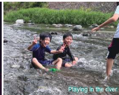
Playing in the river

On the final day, the children visited Oshino Hakkai and the freshwater fish aquarium, "Fuji Yusui no Sato Aquarium," where they spent time learning while experiencing nature and living creatures. While reluctant to say goodbye to their friends with whom they had spent three days with, the children boarded the bus with smiles on their faces, saying, "We want to come again!" and "It was fun!" The participants ranged from first-grade elementary students to third-year junior high students. For many of them, spending time with friends in nature and away from home, was a refreshing and valuable experience.