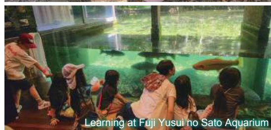
Learning at Fuji Yusui no Sato Aquarium