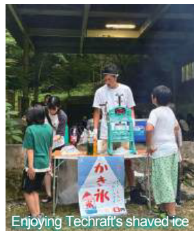
Enjoying Techraft's shaved ice