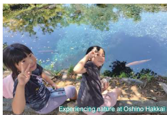
Experiencing nature at Oshino Hakkai

On the final day, the children visited Oshino Hakkai and the freshwater fish aquarium, "Fuji Yusui no Sato Aquarium," where they spent time learning while experiencing nature and living creatures. While reluctant to say goodbye to their friends with whom they had spent three days with, the children boarded the bus with smiles on their faces, saying, "We want to come again!" and "It was fun!" The participants ranged from first-grade elementary students to third-year junior high students. For many of them, spending time with friends in nature and away from home, was a refreshing and valuable experience.