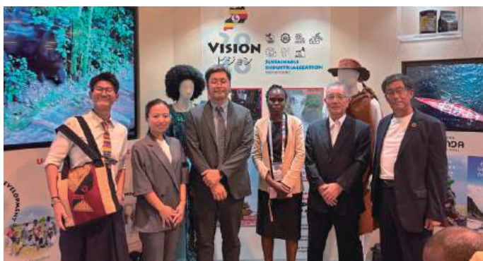
Together with those involved in supporting "KOMOREBI Primary School"