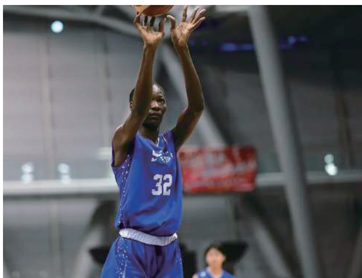
Scoring a goal during the match

The team fully demonstrated the strength they had developed through summer training and away games. The girls' team is competing in the national tournament, and the boys' team fought until the end. FGC will continue to support the success of international students.