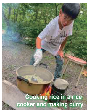
Cooking rice in a rice cooker and making curry

For three days and two nights from July 23rd to 25th, 31 children and 11 staff members visited "Natureland Om", a campsite surrounded by the rich nature of Yamanashi Prefecture.