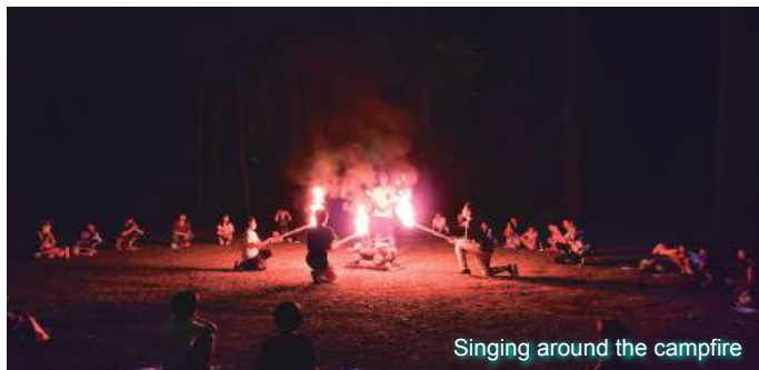
Singing around the campfire