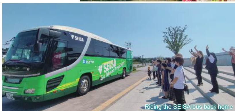
Riding the SEISA bus back home

FGC will continue its support activities to further deepen its relationship with Okuma Town. We will continue to watch over the children of Okuma Town with warmth so that they can be proud of their town and walk forward with faith in the future.