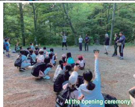
At the opening ceremony

And this summer, that connection gave birth to the "FGC Presents Okuma Koguma Camp in Doshi Village, Yamanashi Prefecture." We invited children from Okuma Town to play to their heart's content in nature, with the aim of refreshing their minds and bodies and encouraging interaction through fun experiences. For the children in the children's club, this was their first experience camping overnight with a large group of people.