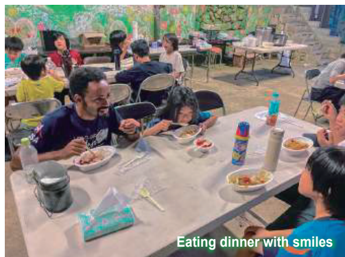
Eating dinner with smiles

On the first day, after arriving and attending the opening ceremony, they immediately started making dinner. Each group worked together to cook rice in a rice cooker and made curry. Whether the group cooked the curry well or burned it a little, everyone was smiling and enjoyed sharing and tasting the finished curry. The staff couldn't help but smile as they watched the children running around energetically in the great outdoors. At night it was fireworks time. They cheered around the small lights of hand-held fireworks.