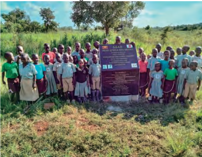
Commemorative monument for the completion of the bridge

FGC will continue to support KOMOREBI Primary School even after the completion of the bridge, including assistance for adding more classrooms. We sincerely appreciate your continued support.