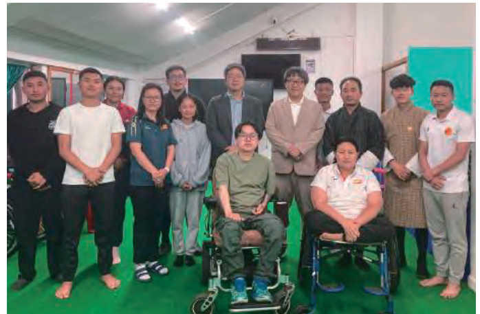
Visited the Rifle Shooting Federation