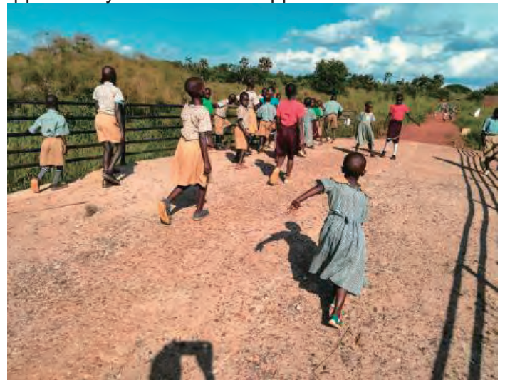
Children crossing the bridge on their way to school