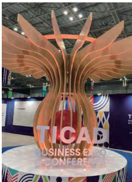
TICAD exhibition hall

The 9th Tokyo International Conference on African Development (TICAD 9) was held in Minato Mirai, Yokohama, for three days from August 20 to 22. TICAD is an international conference on the theme of African development, and many people, including heads of state of African countries, visited Japan.