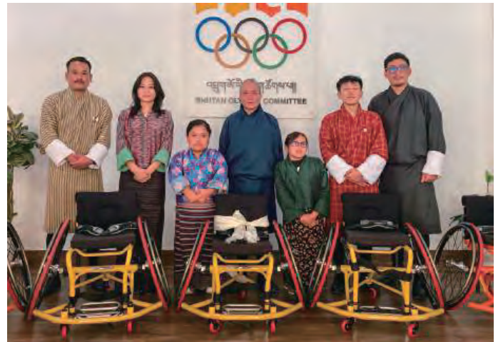
Wheelchairs presented to BPC

cherishing the vision of FGC, we will implement each program together with the people of Bhutan. We will continue our activities to foster a society that respects diversity through sports and education.