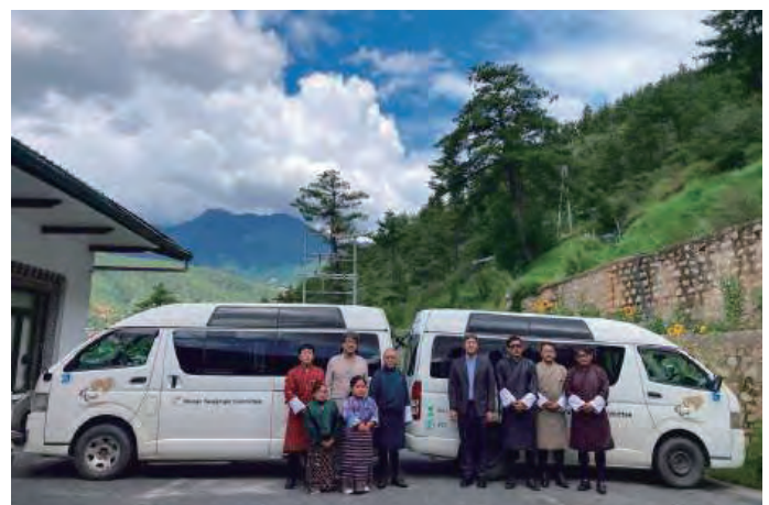
Welfare vehicles donated in 2019, Still in use today