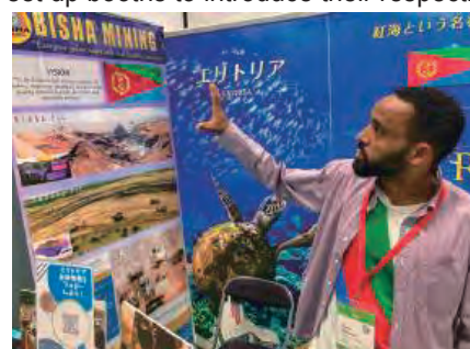
Introducing Eritrea's industries

The venue, Pacifico Yokohama, also hosted an exhibition event called the "TICAD Business Expo & Conference," where many Japanese companies shared their technologies with African countries, and in an area called the "Africa Lounge," African countries set up booths to introduce their respective industries and businesses.