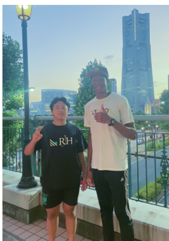
Summer holidays with his teammate in Yokohama