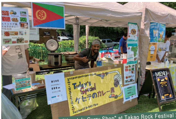
"Kesete's Curry Shop" at Takao Rock Festival 2024