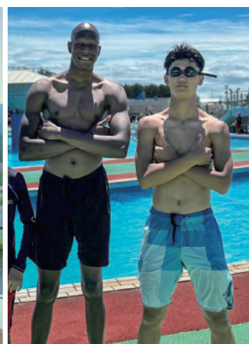
First time at Oiso Long Beach