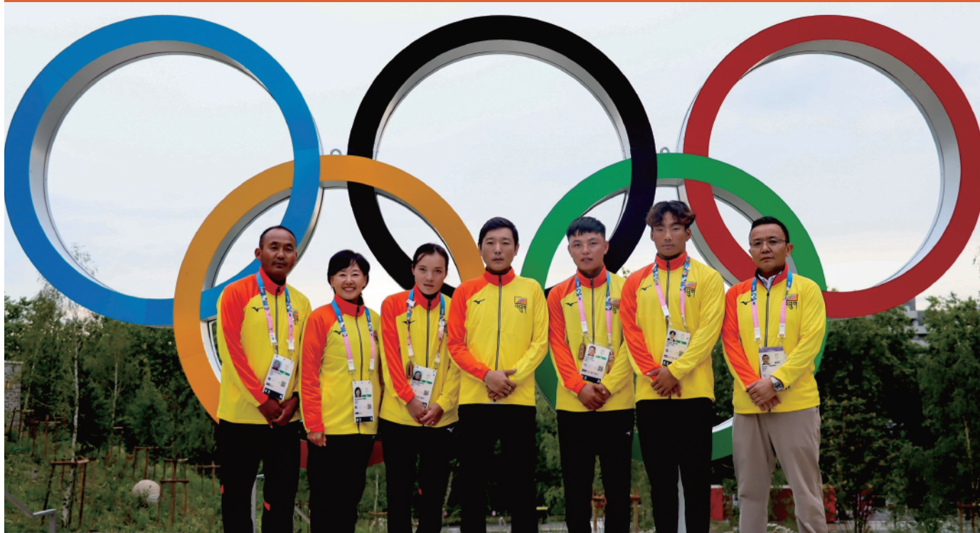
The Bhutan Olympic Team and BOC Chairman HRH DASHO JIGYEL UGYEN WANGCHUCK (center of photo)