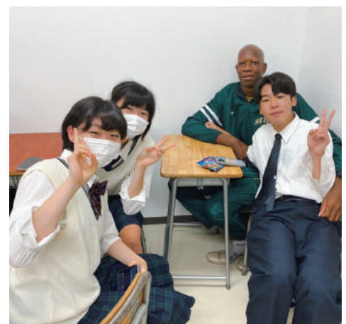
With his classmates during a morning routine