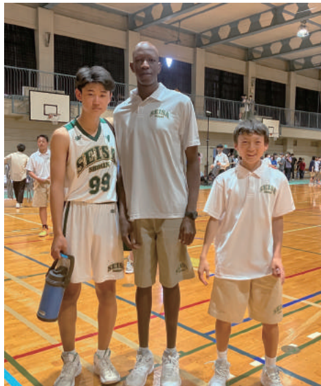
With his teammates