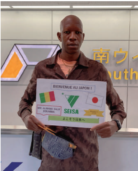
Almage arrives at Narita Airport