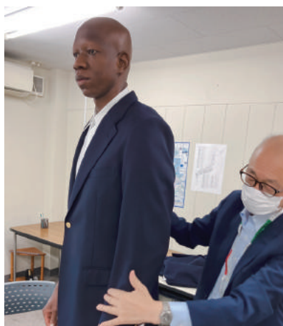
Custom made uniform! Looking forward to its completion