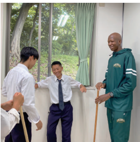
Participated in school cleaning activities