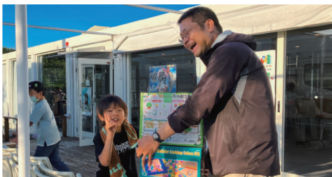
Handing over donations to children in Okuma Town

We will continue to collect donations to Okuma Town, and we thank you in advance for your support.