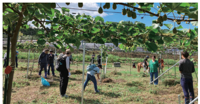
"Flowers, kiwis, and horses" event