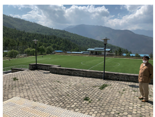
RTC Football field