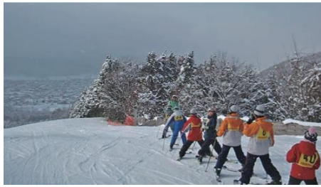
<Enjoyed ski by watching landscape of Ashibetsu City>