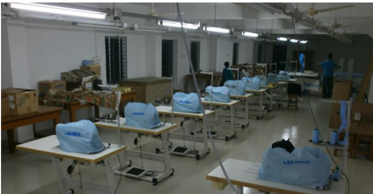
<Inside of factory>

This factory provides opportunities to children to learn skills to become independent and to become a person to support orphanage and society. This needs long-term support; especially in area of personnel development thus FGC will continuously be involved in development of this establishment.