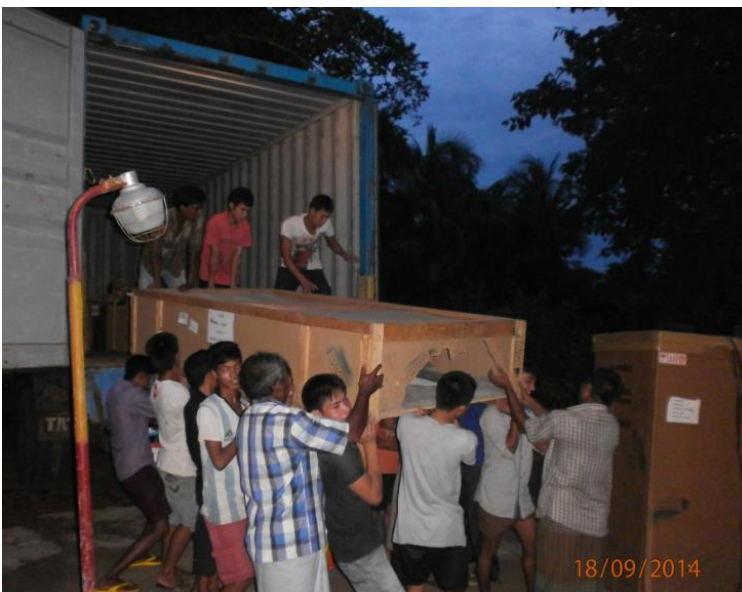
<Youth in orphanage carrying sewing machines>