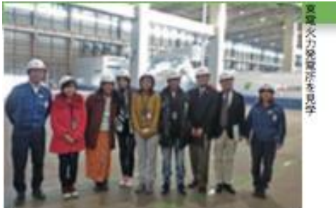
Visiting Thermal power station at Tokyo Electric Power Company