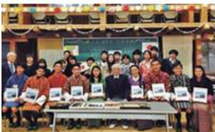
Farewell party (Top-Right)