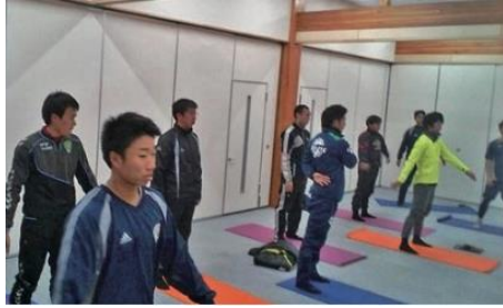
<Yoga lesson for soccer trainers>