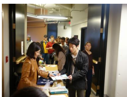
<Distributing FGC NEWS>