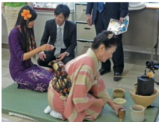
<Experienced Japanese Tea Ceremony on "Myanmar Day">

At the wrap up discussion, 5 participants discussed eagerly what they have learned in visited places and what they put add value to and each person made a speech at the completion ceremony. They promised to bring SEISA's idea and SEISA's Three Guiding Principles back and execute in their home country.