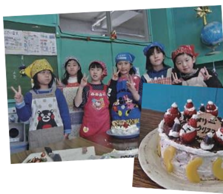
<Enjoyed making cakes>