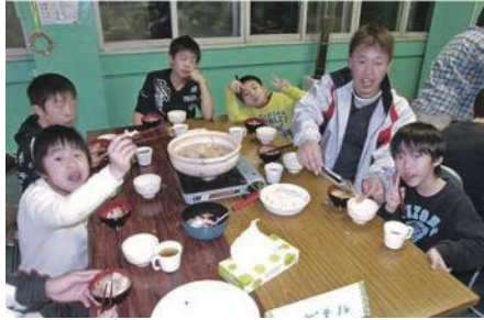
<Lunch party with Ashibetsu City people>