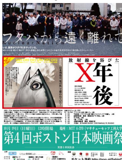
<Boston Film Festival Flyer>

4 years after the Great East Japan Earthquake, there are a lot of Boston residents who are giving support continuously to the disaster stricken areas. They are students, businessperson, housewives, entrepreneurs, professors; their backgrounds, ages and professions are diverse. Those diverse people got together, co-operated and organized this festival with support of the Consulate-General of Japan and the Japan Society of Boston.