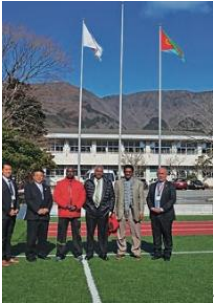
<Visiting SEISA Hakone Campus>