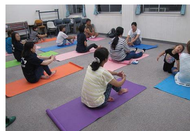
◆ Yoga lesson to parents