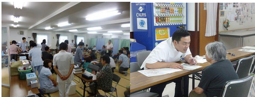
Health Check (Left) & Consultation by Social Psychologist (Right)

On the other hand, people's weight decreased. This is because they are getting less worried and have started to do exercises regularly. Doctors who checked their condition also said "they smile more than before". It seems they have now less anxious about their houses and their living life.