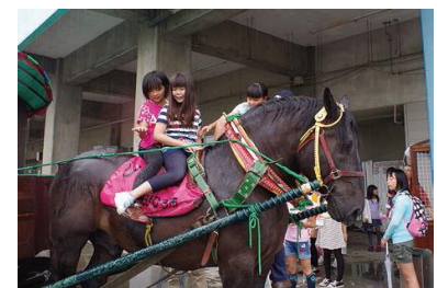
◆ Horse riding