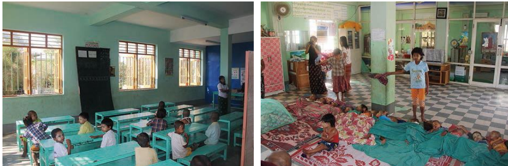
Classroom in the orphanage