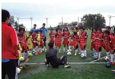
◆ Goalkeeping exercise