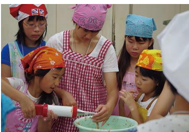
◆ Making sausage