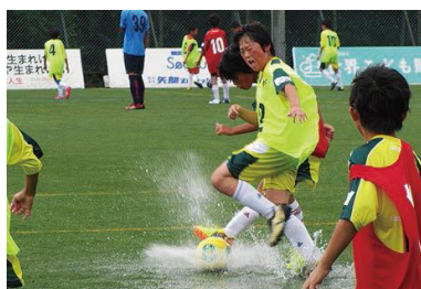
◆ Under heavy rains