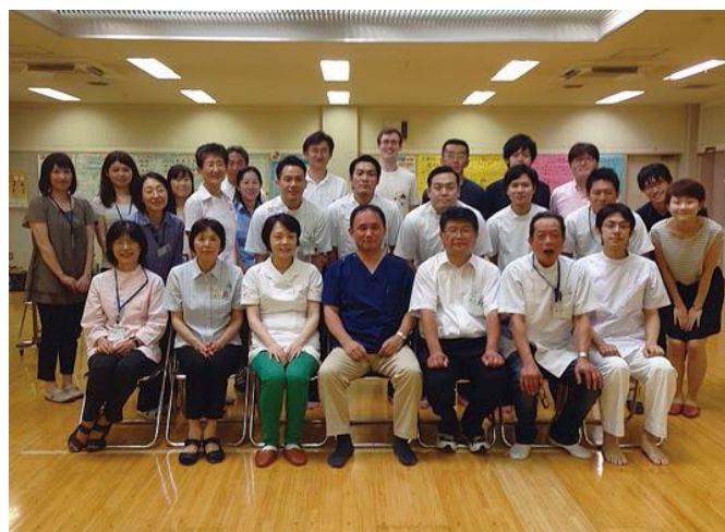
Health Check Team (Doctors, Student Volunteers, FGC Staff)

I would appreciate it if you could continue to support Soma City residents. Thank you.