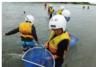
• Nature observation in river