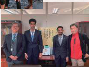
With his teachers at SEISA Dohto University