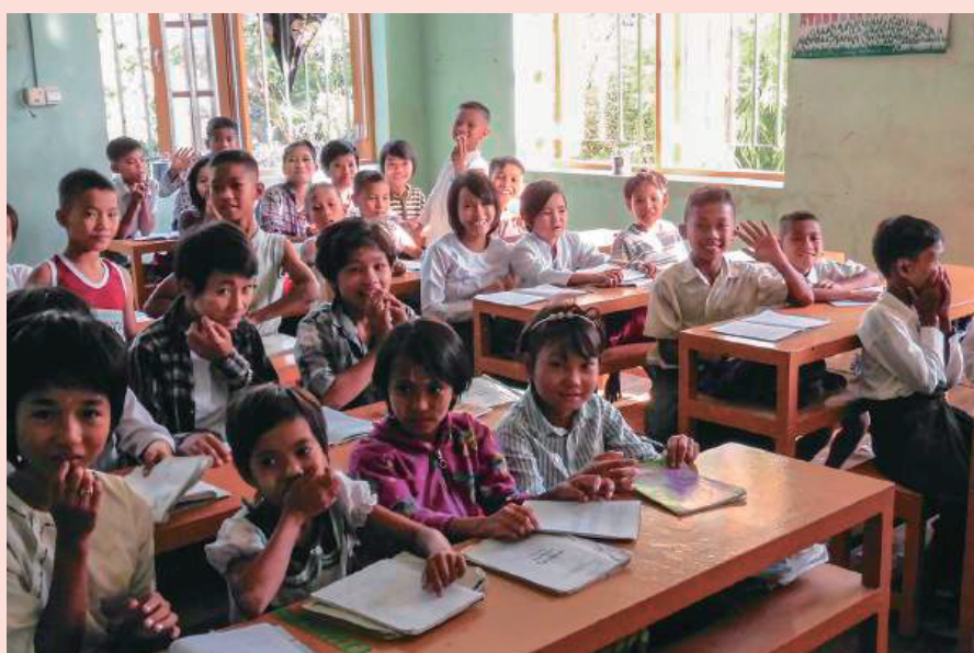
Children studying at an orphanage in Myanmar

We will continue to provide updates on how your support is being used. Thank you again for your continued cooperation and compassion.