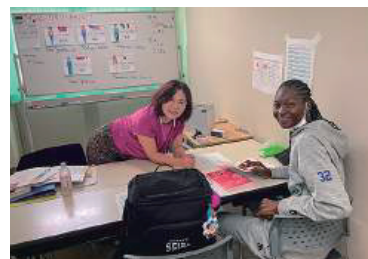
In Japanese class with her teacher.

We will do our best to support her so that she can enjoy a safe and fulfilling school life. We wish her productive and rewarding years in her studies, daily life, and basketball.