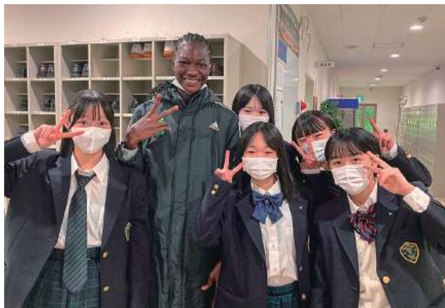
Made friends at school. A fulfilling start to school life.