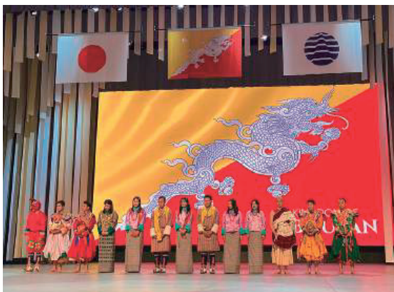
Scenes from the Kingdom of Bhutan's National Day