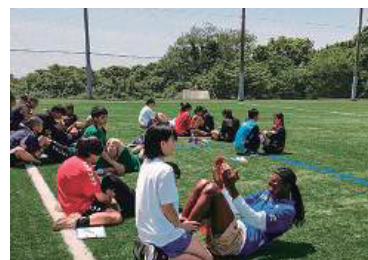
Taking on her first sports test!

This is the first time an international student has come from Nigeria, and also the first time the girls' basketball team has welcomed an international student. Since her arrival coincided with the spring tournament, she immediately began practicing with the team.