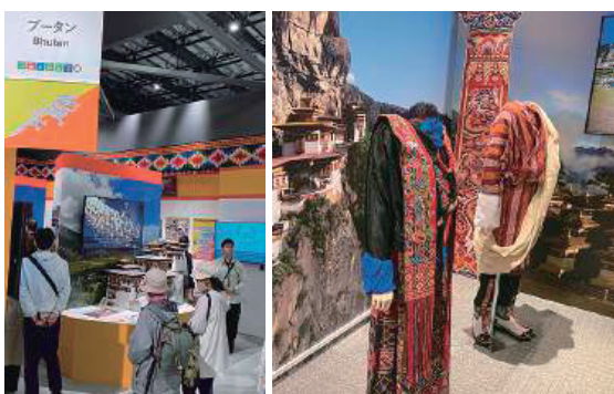
The Bhutan Pavilion exhibitions attracted many visitors

Members of the Bhutanese community living in Japan, as well as many visitors interested in Bhutan, also participated in the ceremony and cultural events, creating a warm and engaging atmosphere for international exchange. In recognition of its past contributions—such as educational support and sports exchange with Bhutan—the Foundation for Global Children (FGC) was honored to be officially invited to the ceremony and gladly attended.