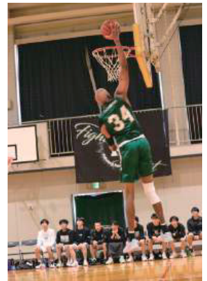
Plays an active role in games