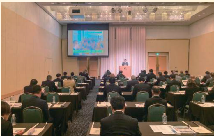
Approx. 50 people attended the meeting