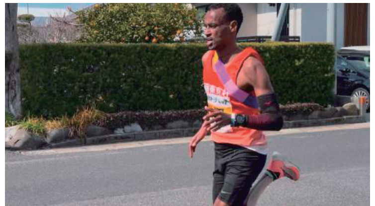
Won the section prize at the Kagoshima Prefectural Ekiden Race!

First up is the 72nd Kagoshima Prefecture Lower Round Relay Race. He participated in this race, which was held from February 15th to 19th, 2025, as a member of Kawabe District / Nansatsu Tokyosha. He showed brilliant running over three districts: District 1 on the first day, District 3 on the third day, and District 10 on the final day. In particular, in District 1 on the first day, he set a new district record and won the district prize in a fierce battle where the top runners from each district gathered.