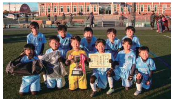
The winning FC Haraichi players