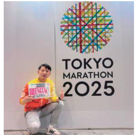
First Bhutanese to compete

He said, "I would like to use my experience in Japan to create an environment in Bhutan where people can easily try sports while working." After returning to Bhutan, with the cooperation of BOC, he plans to hold a Dental Hygiene & Running Clinic for the children of Bhutan, spreading awareness of the importance of dental health and exercise to children.