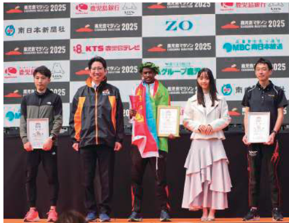
Scene from the award ceremony