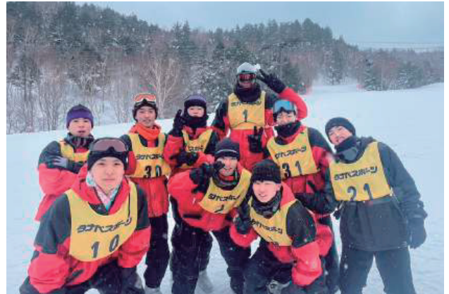
Saw snow for the first time in his life

April 2025, will be the start of his final year. His goal as a third-year student is to compete in the national tournament with his fellow basketball teammates, and also to take the Japanese Language Proficiency Test N3 to further deepen his understanding of the Japanese language.