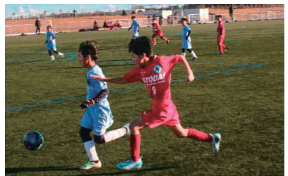
Players chasing the ball

Now in its 14th year, this tournament was well received by children and those involved, with many saying they were looking forward to next year. We hope to continue these kinds of exchange activities together with the local community.