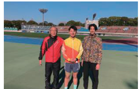
Joint practice with the SEISA Kokusai High School Shonan Athletics Club