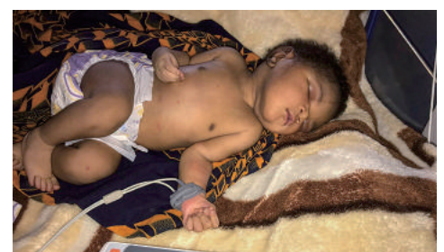
A baby lost mother soon after birth