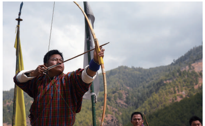
The archer is targeting.

However, it is not only the unique rules and tools that make "Da" a national sport, but also the fact that the bows and arrows are the tools that were closely related to Bhutanese daily life traditionally. They played vital role in various occasions, such as hunting, celebrations for new births and house-warmings. In addition, arrows are often left as tributes and offerings to the local gods. "Da" is a traditional game that is now protected by the Bhutan Indigenous Games and Sports Association, BIGSA, and is still an essential game for the Bhutanese today.