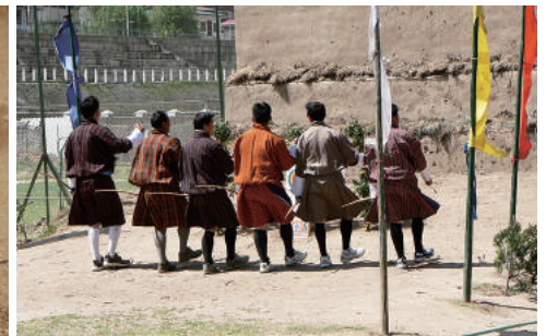
Dance for celebrating team member's hit.