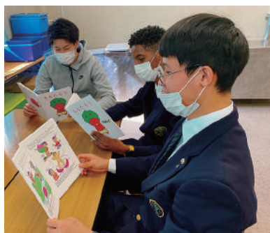
Reading a Japanese folktale "Momotaro"