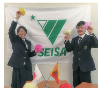
Thank you for three years!