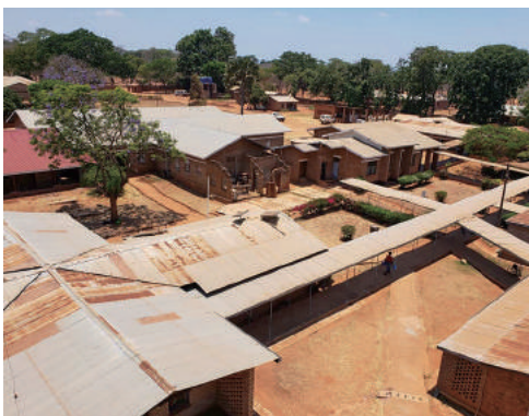
Embangweni Mission Hospital