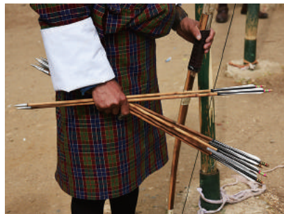
"Zhu", the bamboo bow and its arrow.